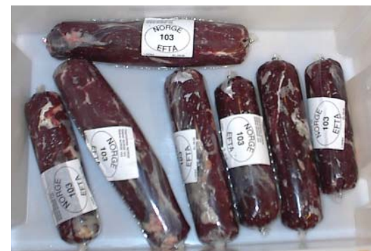
Right: Final products using the Pi-Vac Elasto-Pack system

strong forces on the muscles and hinders longitudinal muscle contraction. A study of the system applied on beef longissimus dorsi (LD) muscles chilled at air temperatures of 4 or 12°C showed that the process increased the tenderness of the LD at either temperature. This means that the muscles can be chilled rapidly without detrimental effects on tenderness. A more attractive shape of cuts from the muscles is an additional benefit of the process.