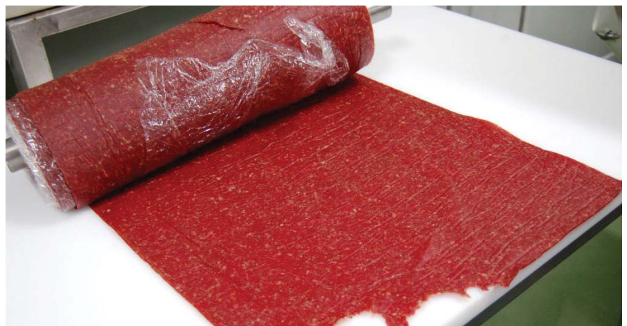
Right: The OSMOFOOD® process