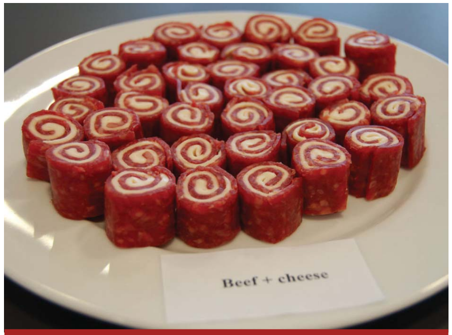
An example of OSMOFOOD® products