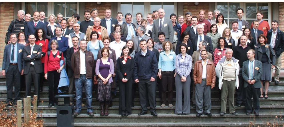
Below: The ProSafeBeef team

Pillars and to perform training and dissemination to end users. Throughout the life of the project, demonstration activities will be organised to prove the technological and economic viability of selected new technologies at industrial or pilot scale. A “core team” of eight scientists and technological trainers has been set up to promote the transfer of knowledge and technologies to meat companies and particularly SMEs. This core team will continue to identify new technologies appropriate for demonstration from the project, and will be closely involved with future demonstration activities.